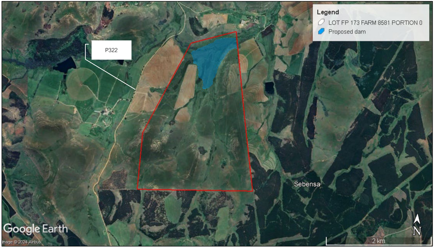
Figure 3: Satellite image showing the proposed project property boundary with the proposed dam shaded in blue.